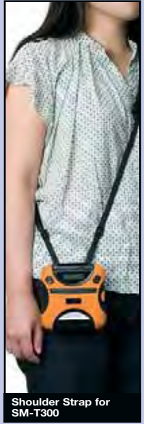
Shoulder Strap for SM-T300