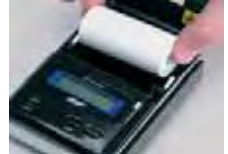
Easy Paper Loading