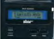
Blue Light Display

Sophisticated pocket size printer capable of producing high quality output at a fast 80mm/sec. with Bluetooth and Serial connections as well as a cover open sensor and power save facility