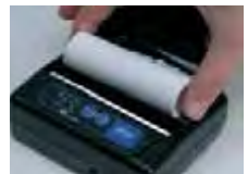
Easy Paper Loading