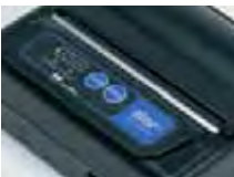
Magnetic Stripe Reader with Serial & Bluetooth

Pocket size 80mm workhorse with an extended battery life of 10 hours with Bluetooth for wireless communication and Serial for printer settings and set-up