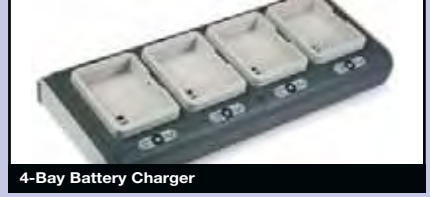
4-Bay Battery Charger