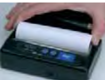
Easy Paper Loading