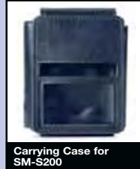
Carrying Case for SM-S200