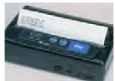
Wide 112mm Paper Width

Wide, 104mm output for data filled service reports, delivery notes or law enforcement parking or motoring tickets in a compact case