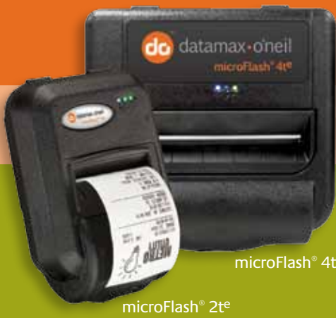
microFlash® 4t e